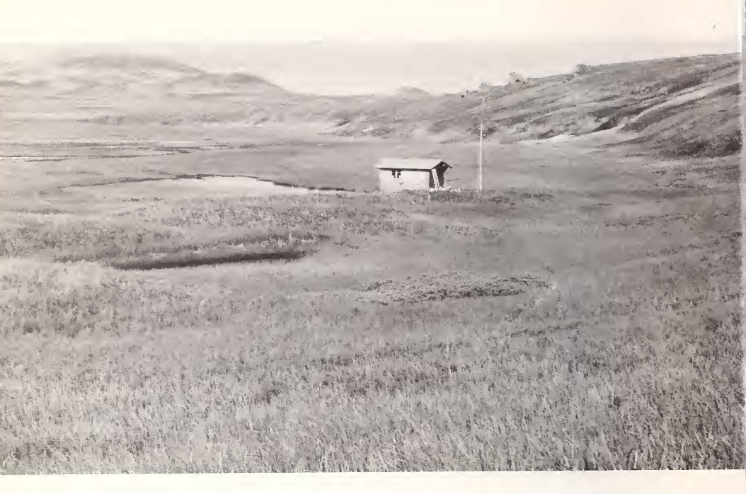
Fig. 9. Wet meadow adjacent to Nanvak Bay, 24 July 1976.

western portion, fast or close ice begins to form as early as October and may last until May; in some years, pack ice extends to several kilometers south of the study area (Brower et al. 1988). In summer, sea surface temperatures reach 11° C.